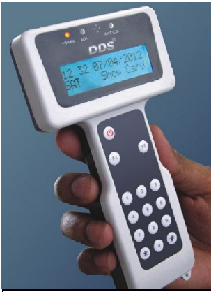
Hand Held Reader with GPRS